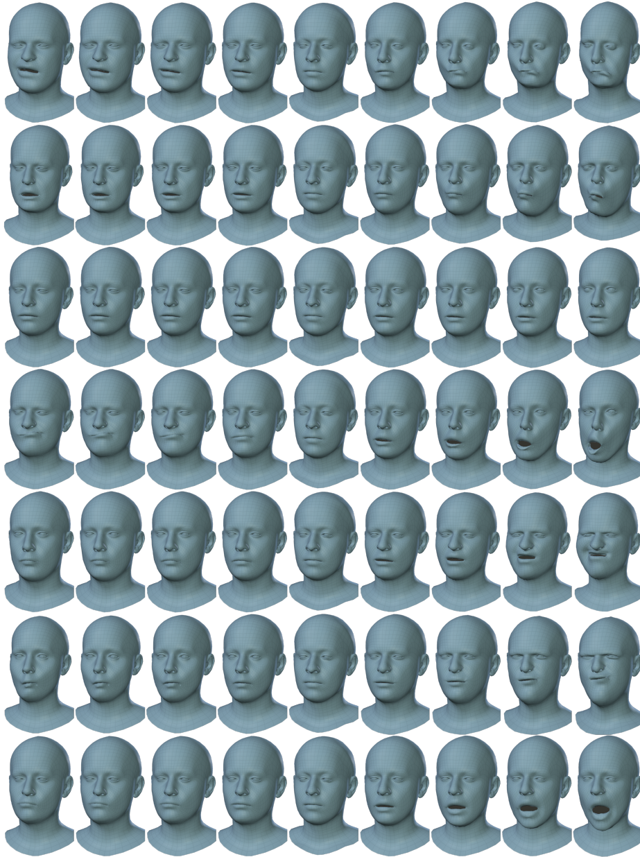
Fig. 2. Sampling from latent space of CoMA, each row is sampled along a particular dimension.